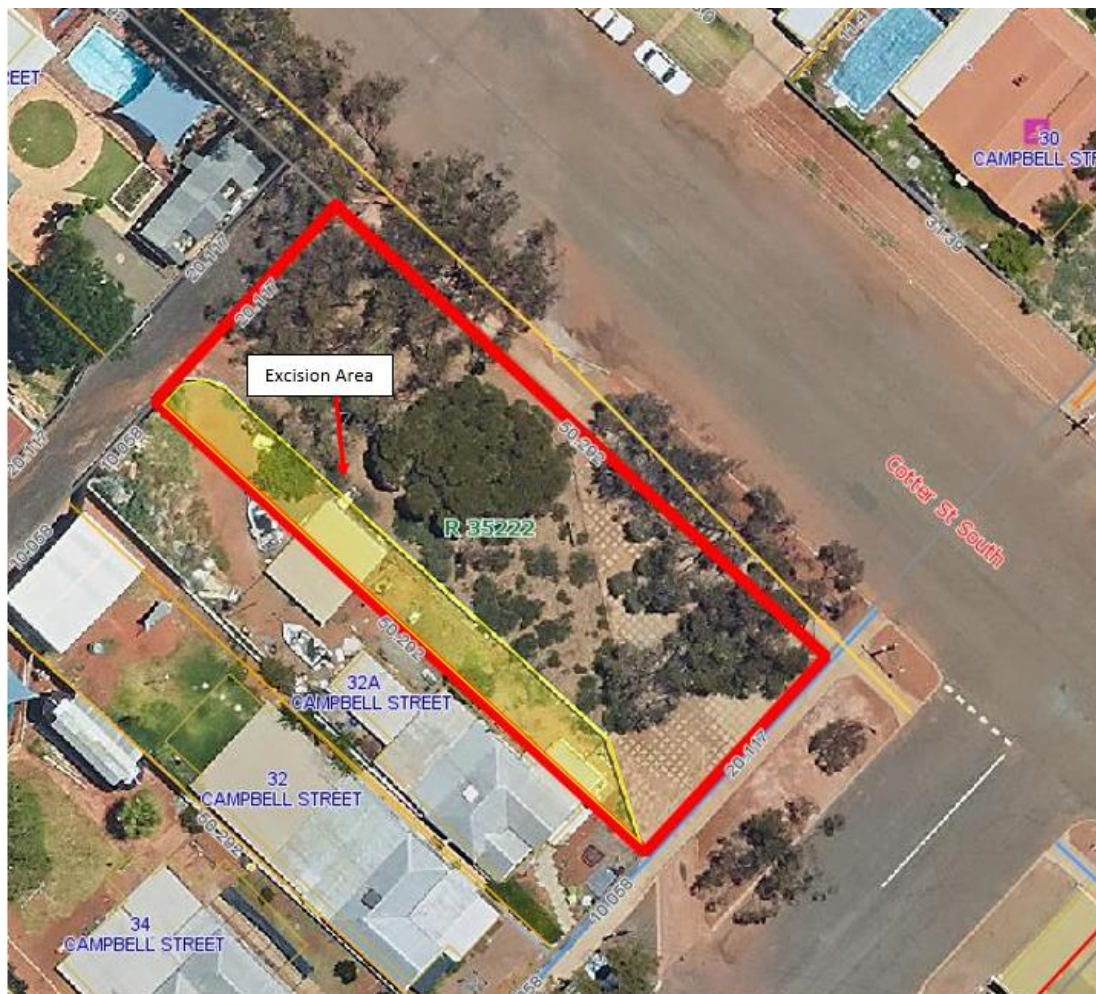
Figure 1 – Reserve 35222 and neighbouring Lot 32 (32A) Campbell Street, Lamington